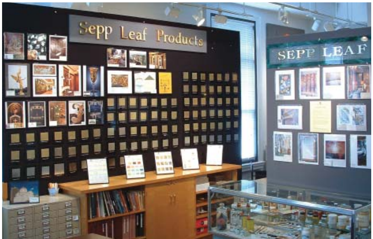
Right: Along with the awards, Sepp Leaf Products unveiled its newly designed showroom and Pride of Place Gallery earlier this year. The gallery showcases customers' decorative projects and displays samples of gold, silver and metal leaf. The company also hosts monthly seminars on interior and exterior gilding processes.