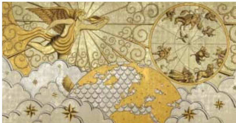
"Aurora Borealis," one of several verre églomisé murals created by Christianson Lee Studios and installed on the Queen Mary 2, measures 10x5½ ft. The Ridgefield, CT, company won a 2005 Sepp Leaf award in the Verre Églomisé category.