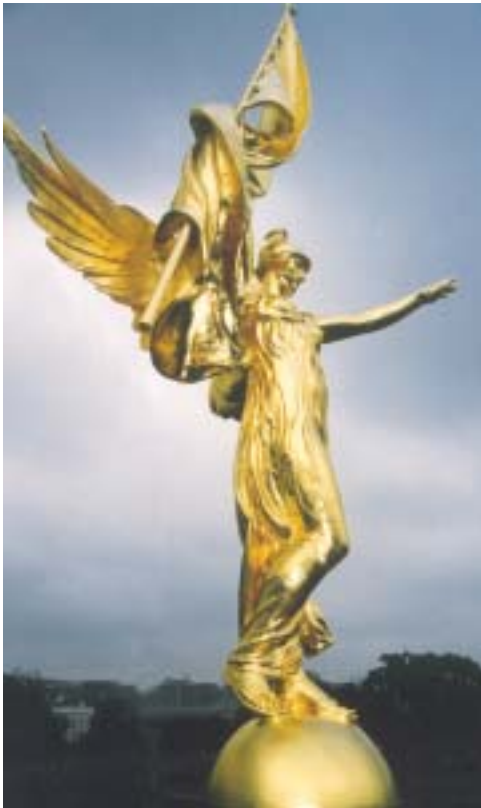
Left: Daniel Chester French's "Winged Victory," which sits atop the First Division Memorial in Washington, DC, was re-gilded by The Gilders' Studio, winning the Olney, MD, company a 2005 Sepp Leaf Award in the Exterior Gilding category.