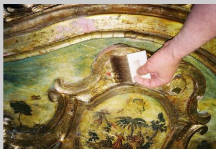
Restoring a water gilded Headboard

(Look for the Winter Issue of The Gilding Arts Newsletter this December!)