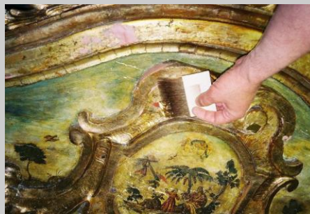
Restoring a water gilded Headboard

(Look for the Winter Issue of The Gilding Arts Newsletter this December!)