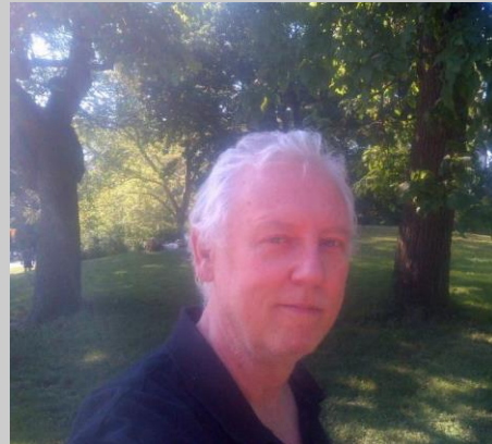
After class, NY, Central Park, 2016

Just a quick word to wish all the mothers a Happy Mother's Day! And thank you to all of you who have taken time from your busy schedules to attend one of the many recent gilding classes we have had. It was wonderful to spend some class time together as we try to understand all of the possibilities and the complexities of the gilding arts. Time goes fast but it was truly a