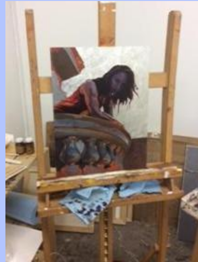
Work in Progress, oil paint with aluminum leaf background applied with acrylic emulsion, 2017, Josh Pemberton

Tempera paintings and water gilded backgrounds of Fred Wessel .