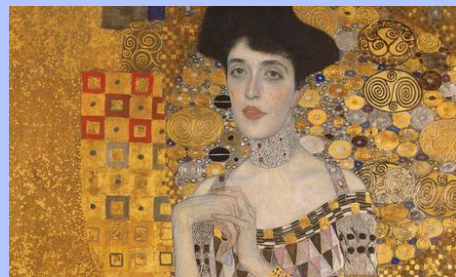
Portrait of Adele Bloch-Bauer, 1907, Gustav Klimt, Neue Gallery, New York

These various conversations with painters eventually led me to develop a gilding class specifically for fine artists where together we could explore the possibilities of gilding in combination with other art mediums, techniques, and materials while I help to offer a grounding in gilding principles and technique - how to manipulate loose gold leaf, to use the gilder's