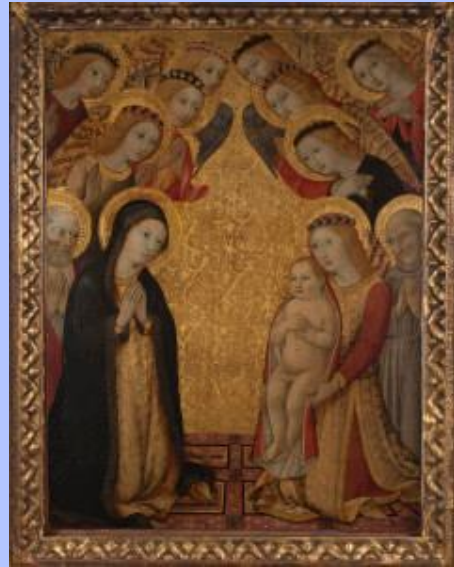
Adoration of the Child, 1473, Sano di Pietro