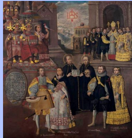
Union of imperial Inca descendants with reduced House. Escuela Cuzqueña (18th century ). Pedro de Osma Museum, Lima.

The combination of painting and gilding within works of art can be found throughout history in such forms as manuscript illumination where the earliest surviving examples date to the 4th to 7th century, 10th - 12th century Byzantium Icons, and the beautifully elaborate brocateado de oro Peruvian techniques of the 17th - 18th century Cuzco School.