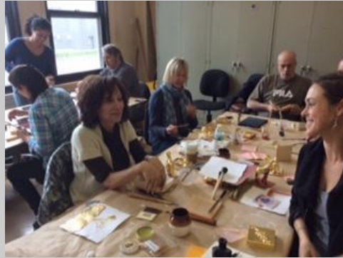
Traditional Water Gilding Class Summer, 2017