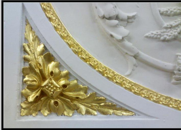
Oil Gilded 23k Gold Leaf