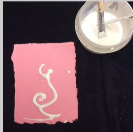
Pastiglia - dripped gilder's gesso - on India paper.

aces. We will address some of the pressing questions that many have: Should I gild first or paint first? Should I begin by using the imitation leaf? How do I handle this leaf that blows away everytime I breathe??! :)