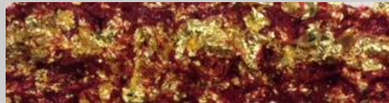
23kt Gold Leaf embedded in a mass of oil paint on canvas.

Good timing for sending in those questions!).