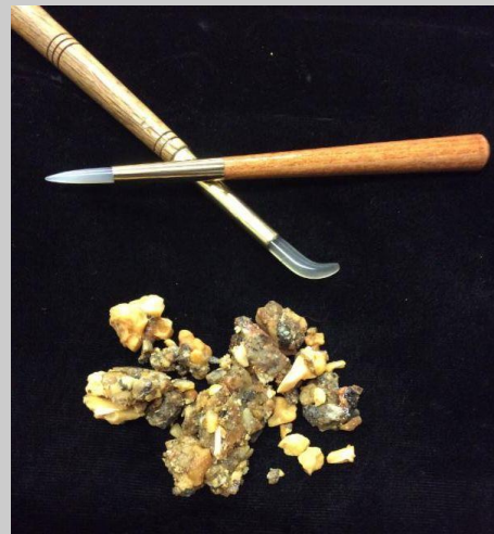
Gum Ammoniac, a gum-resin from the herb Dorema Ammoniacum

raordinary ways of incorporating leaf into their creations, whether through the practice of sacred Iconography or the gilding of Buddhas or as gold and silver grounds for hyper-realistic pop-surrealistic paintings, the options of using the techniques and materials for gilding seem limitless.