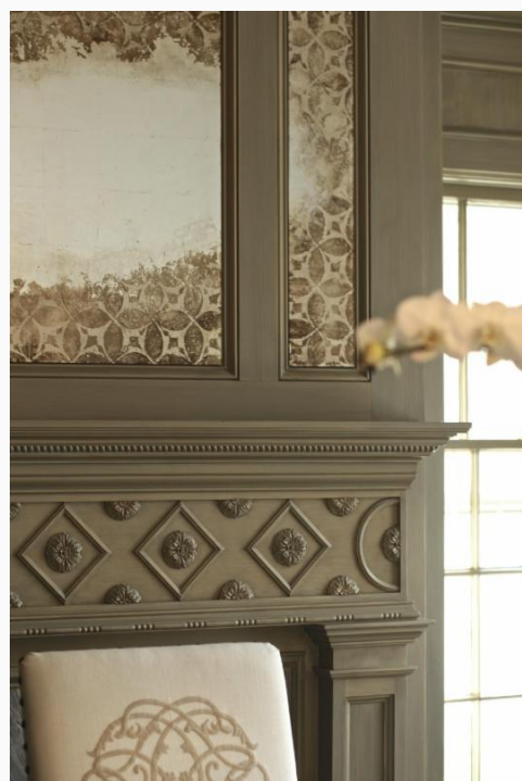
Above and right dining room fireplace with Italian aluminum leaf verre eglomise by Simes Studios © Simes Studios 2017