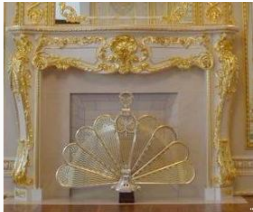
23 karat Italian gold leaf over plaster mantel by Mark Randall Studio

Here in the northeast, winter has presented its calling card a few times already – in fact, I write this while snow falls over Manhattan’s parks, bridges, towers and townhouses. And shoppers. While I don’t love the fact that it gets dark by 4 o’clock, one nice perk is that the city’s lights are aglow early, abundant and cheering. Early evening walks are even more beautiful than those taken in muggy summer, since facades, spires, lampposts, and especially people sparkle with hospitable illumination.