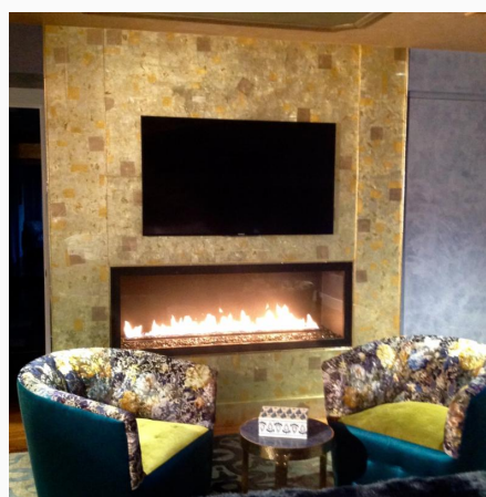
Verre eglomise glass surround with Lemon Gold, Moon Gold and Imitation Gold Leaf

And, because we modern cave dwellers love to embellish, we’ve devised delightful methods to extend the physical and visual heat we enjoy, to spark the light and manifest the holiday glow. Often, the decoration out-dazzles the fire itself!