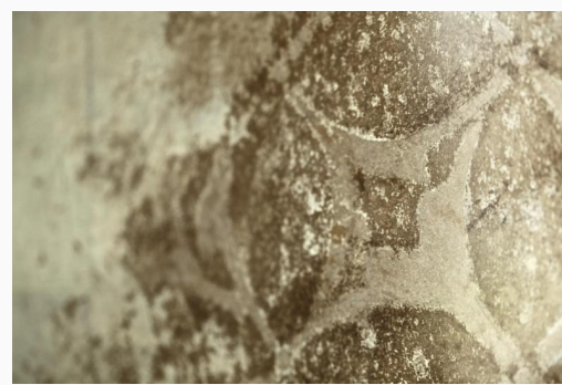
Verre eglomise detail Simes Studios

There’s a heightened feeling of warmth and congeniality when one comes in from the cold bluster of the outdoors.