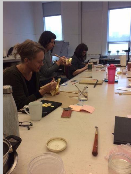
Water Gilding class in Ontario

For our friends in Kentucky, our make-up sessions will be arranged soon as we look at both a Louisville and possible Lexington offering. Thank you for hanging tight due to February's crazy set of snowstorms and an extremely busy gilding season - our time is coming!