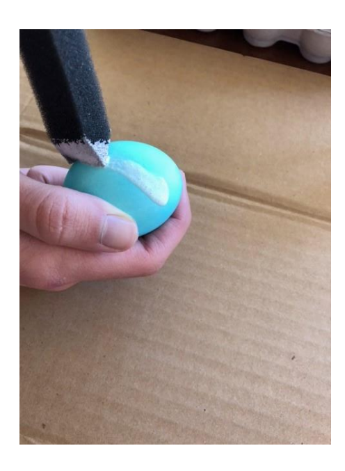
Applying Size to make a stripe