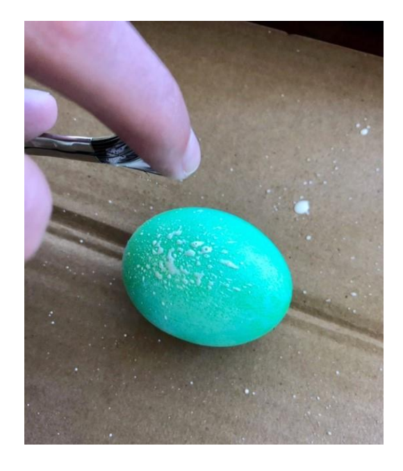
Flicking the craft brush to speckle size

Load your foam brush with Gilding Size to make a freely brushed stripe of size on eggs. Flick Gilding Size with your craft brush to create specks of size. You can also trail Size to make abstract shapes of size. These combined patterns create an eye-pleasing array when gilded!