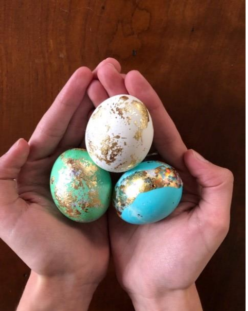
Your eggs are ready to set out as a festive centerpiece!