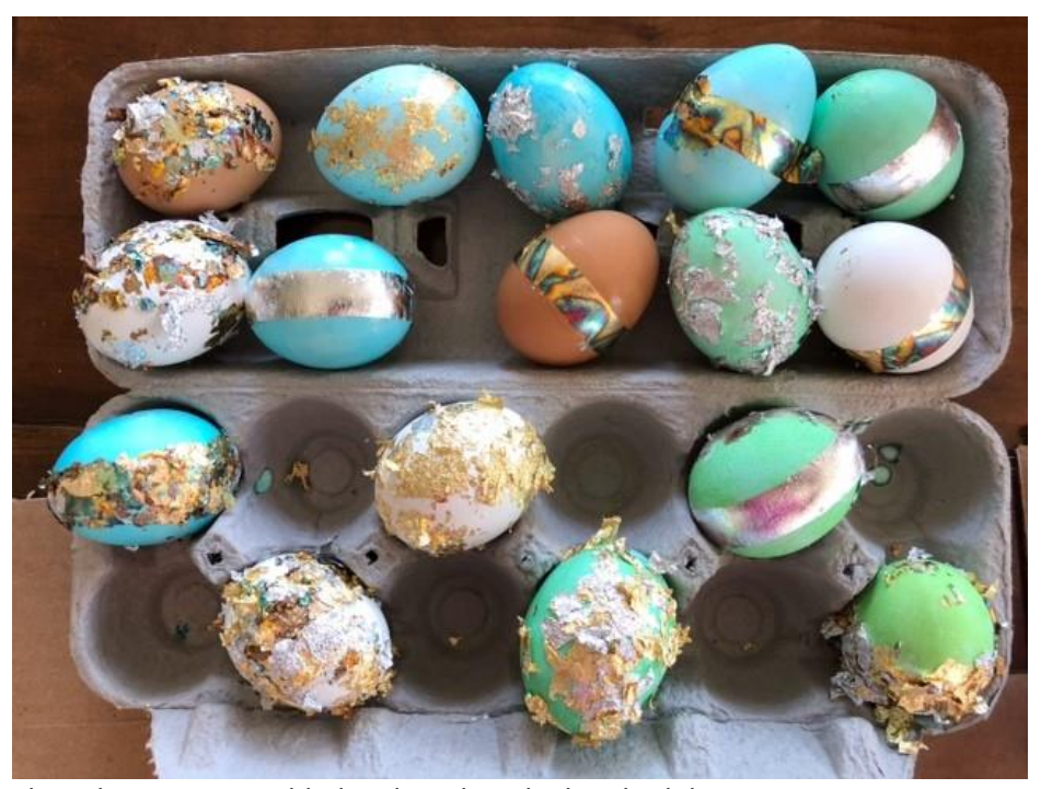
These beauties are gilded and ready to be brushed down.