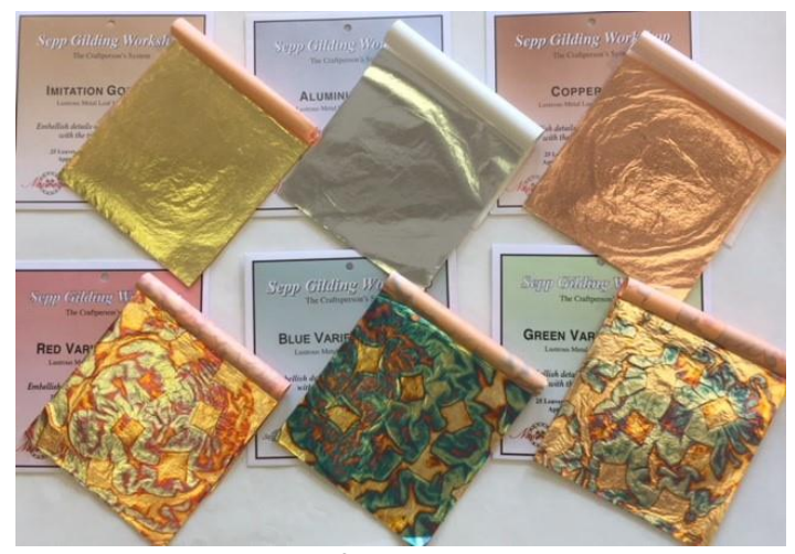
Sepp Gilding Workshop Leaf – Imitation Gold, Aluminum, Copper, and Red, Blue and Green Variegated

Gray primers, and Imitation Gold, Aluminum, Variegated Red, Blue and Green Leaf sold separately.