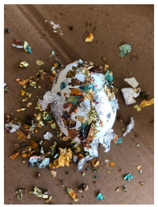
Press firmly to ensure the leaf adheres to the size, especially at the edges of stripes.