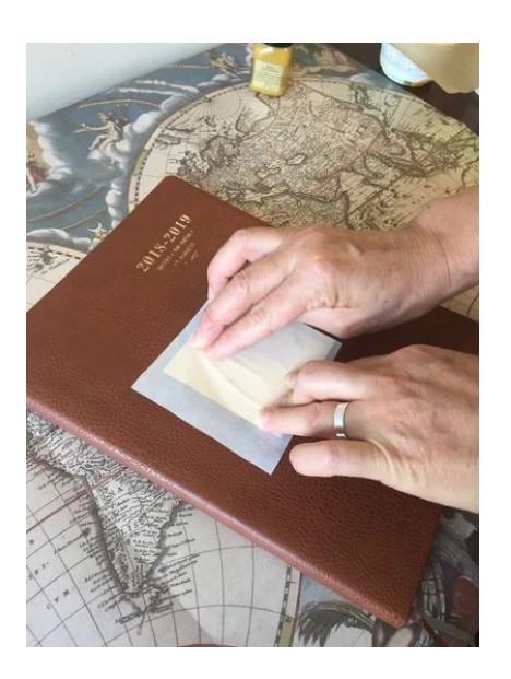
If you like, you can mask around the initial to keep the gold from potentially sticking where don't want – genuine gold is so soft it loves to cling to certain surfaces.

Fold back the top pages of the book of 23kt patent gold leaf to expose the topmost gold leaf. Pick up the gold leaf by holding the paper backing without touching the gold. Place the gold leaf face down over the initial – it should cover the letter completely. Rub the backing paper to ensure all the leaf bonds with the size.