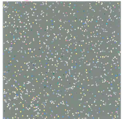
GE3 Multi (10%)