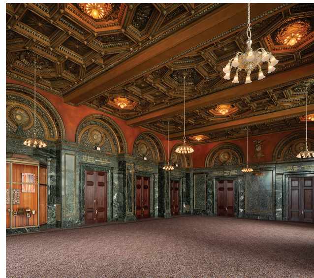
Treatments by the EverGreene team at the historic Egyptian Theatre in Los Angeles, left, included conserving, repairing, recreating flat and decorative plaster elements, painting flat surfaces, and reinstating decorative stencils and patterns.