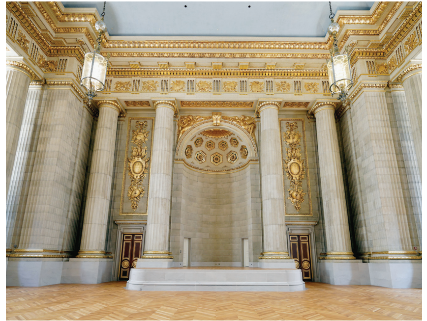
Left, at First Church of Christ in Woodbridge, Connecticut, John Canning Co. created the ornamental painting that gives the illusion that the ceiling and walls are higher than they actually are. The technique also makes the apse look deeper.