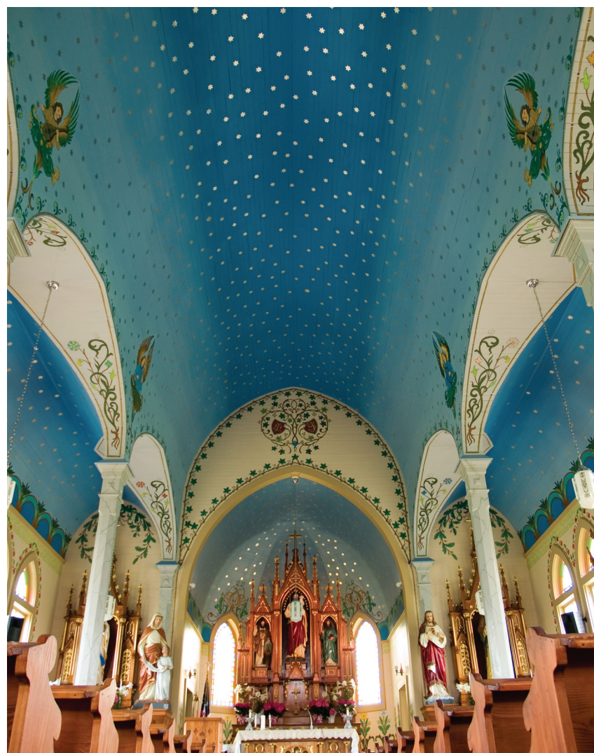
The interior of St. Mary's High Hill, one of the famous "Painted Churches of Texas," was restored by R. Alden Marshall & Associates.

"Our years of experience in restoration are backed by our training and experiences in mechanical engineering, material physics/sciences, architectural and art conservation, and taking extensive time in becoming knowledgeable of historic trades and historic building practices in