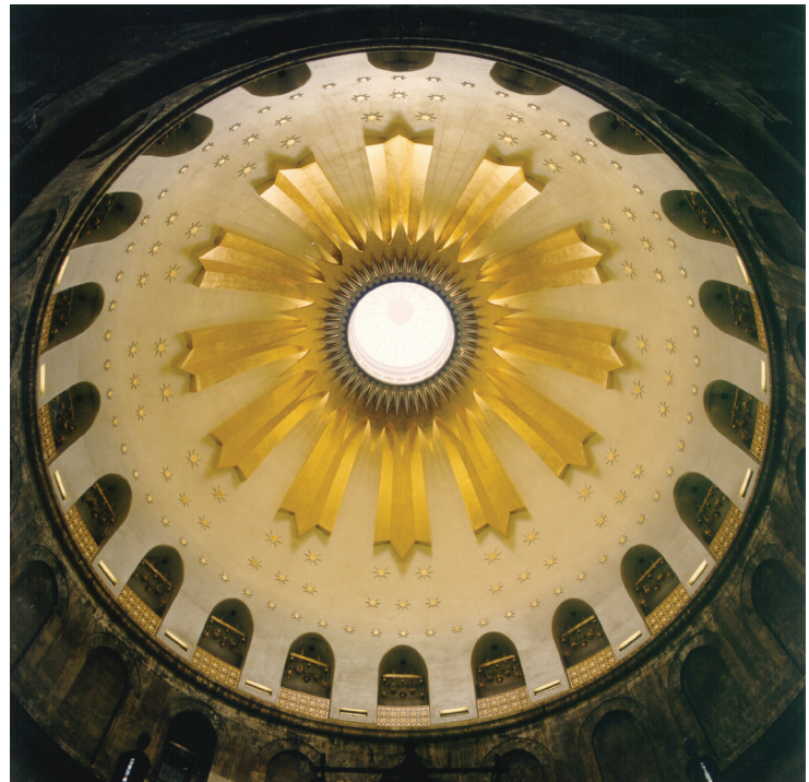
Above, at The Church of the Holy Sepulchre in Jerusalem, The Gilders’ Studio applied a linear textured pattern to the main rays, which were gilded with 23-karat gold leaf as were the stars and rings above it. The team also restored the circa 1869 gilding on the balustrades with 23-karat and 12-karat gold leaf.

He has taught gilding and decorative painting at several organizations, including the Smithsonian and the Society of Gilders. His chapter “Exterior Architectural Gilding” was published in the Archtype Press book “Gilded Metals.”