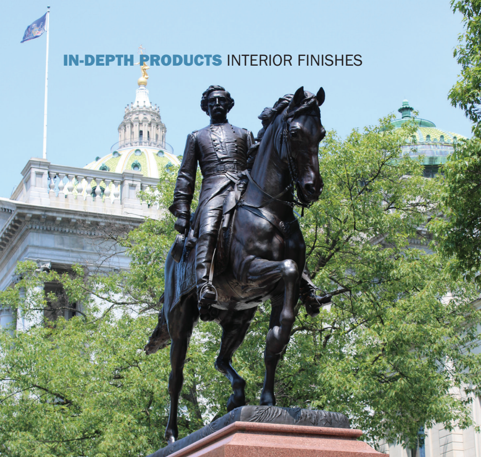
Left, R. Alden Marshall & Associates removed the corrosion and re-patinaed the 1896 bronze monument of Gov. John Frederick Hartranft outside the Pennsylvania Capitol.