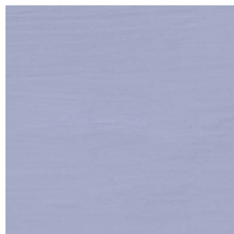
Blue KBE/100, /500, /L, /5L