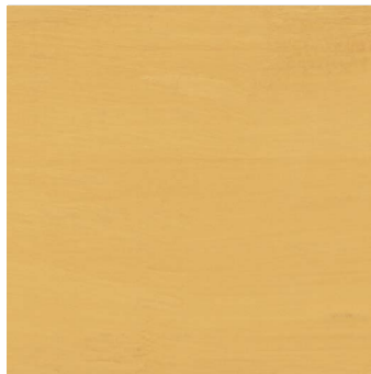
Ocher KBO/100, /500, /L, /5L