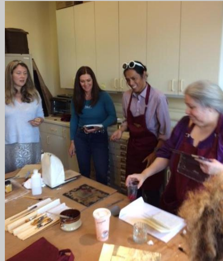
Glass Gilding at Sepp Leaf Products in New York

approach restoring gilded frames and furniture this is your chance! There is also a date for Seattle and Ontario (with more to come).