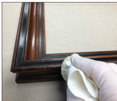
● Wax Filler Sticks can be buffed in to fill cracks, gaps, holes, and scratches

a spatula, and buff with a rag. You can also use the company's Retouch Crayons. The crayons are made from carnauba wax for filling shallow scratches and small nail holes. Simply rub the crayon into the scratch or rub to fill a hole.