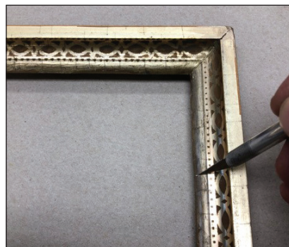
● Using a razor blade to cut matching gesso cracks into repaired areas

The next step was to tone the worn raw wood areas of the frame. I used Liberon's palette wood dye, a line of water-based dyes for coloring bare wood, for this task. I chose the appropriate color and applied with a brush to the worn outer edge of the