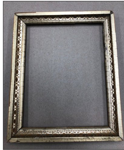
● The frame's original gilt liner before repairs

After that, it was time to start on the mahogany frame. The first step was to revive the surface. Liberon makes two products for this: wax and polish remover, a non-aggressive, strong cleaner to remove dirt, grime, dust, smoke, and old layers of wax from antique furniture without damaging the original finish; and burnishing cream, which removes dirt, super-