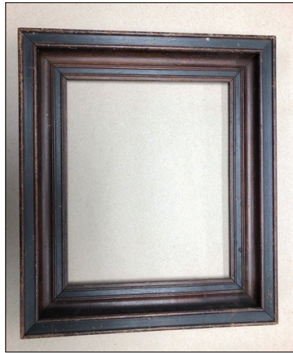
● The original frame before restoration work began

dried, I mixed the same colors of the gilt cream and applied a light coat to blend it all in. To help hide the repair, I took a razor blade and cut some gesso cracks in the repaired areas to match the cracks on the rest of the liner.