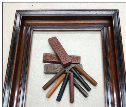
● Fill shallow scratches and small nail holes with Retouch Crayons

Finally, a finish coat of wax was applied to harmonize the surface. Liberon's Black Bison Paste Wax is a blend of fine waxes for nourish-