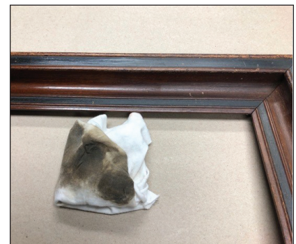
● Burnishing cream can be buffed in to restore a frame's luster

To fill the old nail holes on the sides of the frame, I used Liberon's Wax Filler Sticks, a wax fill for repairing small to medium-size holes, cracks, gaps, and deep scratches. Choose from 16 wood colors, including white and ebony. Shave off a piece of wax and knead in your fingers until warm and soft. Apply to the nail hole, smooth out with