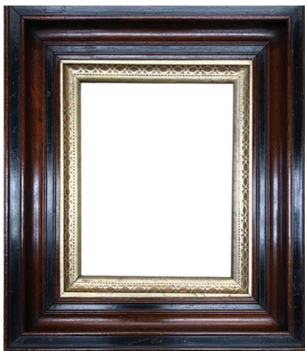
● This nineteenth-century mahogany frame, which includes a gilt liner, was recently restored with the help of several Liberon products. The result: a beautiful frame ready to be used again.

I separated the frame body from the liner to make it easier to work on. The first step in the restoration is to check the corners to make sure they are stable. If they are loose, they will have to be glued back together. This frame was stable, but the corners had separated slightly, which is typical for frames of this period. It was decided to leave it as-is. The mahogany body had dulled over time, with a lot of wear showing on the outer edge of the frame. The liner was basically clean with just a light layer of dust. The liner had