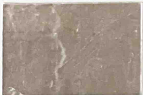
Silver Thin CR00.00ST AW = 25-30g 100% Silver