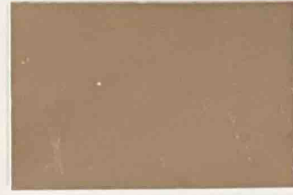
Platinum Metal White CR00.PT/526 AW = 17.5g Gold - Silver - Palladium