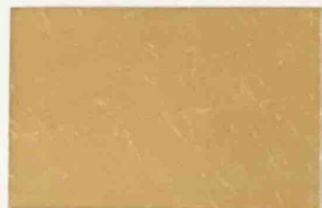
Rosa-Noble & Patent 23.75kt ♦☀ CR23.75RN AW = 19g 98.9% Gold - .5% Silver .6% Copper