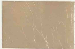
Platinum White CR00.PT/420 AW = 17.5g Gold - Silver - Platinum