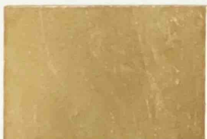
22kt Surface & Patent ♦ ■ CR22.00SF AW = 16g 92% Gold - 6.5% Silver 1.5% Copper