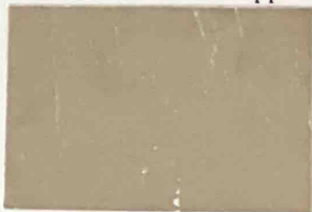
White 9kt ♦ CR9.00WH AW = 16g 49% Gold - 51% Silver