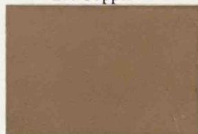
Caplain 20kt ♦ CR20.CL/80 AW = 14g 86% Gold - 5% Silver - 5% Palladium - 4% Copper