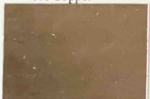
Moon Gold 21kt CR21.00MG AW = 20g 89% Gold - 5.2% Silver 5.8% Palladium