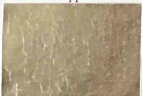
Pale Gold 15.3kt CR15.30PL AW = 16g 63.8% Gold - 36.2% Silver