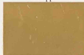
Antique Gold 22.75kt CR22.75AG AW = 18g 94.8% Gold - 3.2% Silver 2% Copper