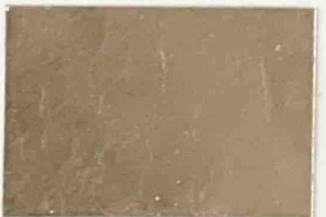
White 12kt ♦ ■ CR12.00WH AW = 16g 50% Gold - 50% Silver