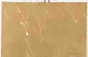
French Red 23kt CR23.00FR AW = 18g 97% Gold - 3% Copper