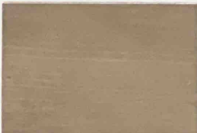
Platinum ♦☀ CR00.00PT AW = 20.9g 100% Platinum

Loose leaf oil Gilded on white paper. The ♦ indicates leaf that is also available in patent form.