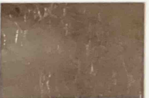
Palladium Glass ♦☀ CR00.PG/80 AW = 16g 100% Palladium